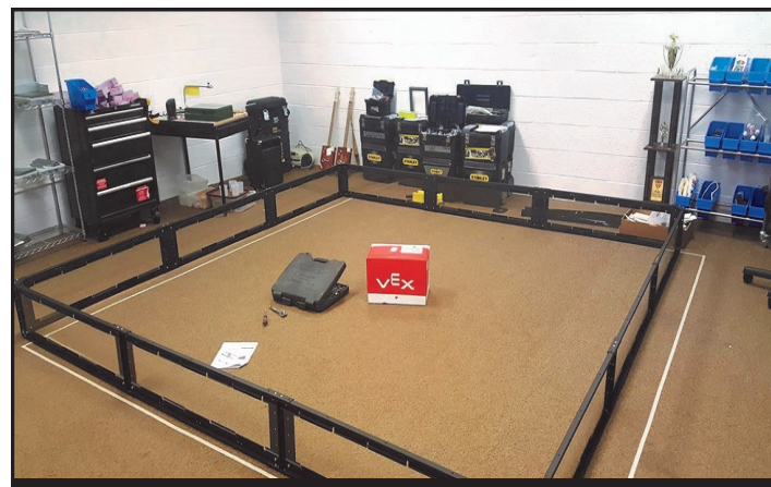
SAMS NEW ROBOTICS CLASSROOM

Competitive Robotics will begin soon. We are working to get all of our supplies and putting the field together. This is being made possible by Grants and donations from